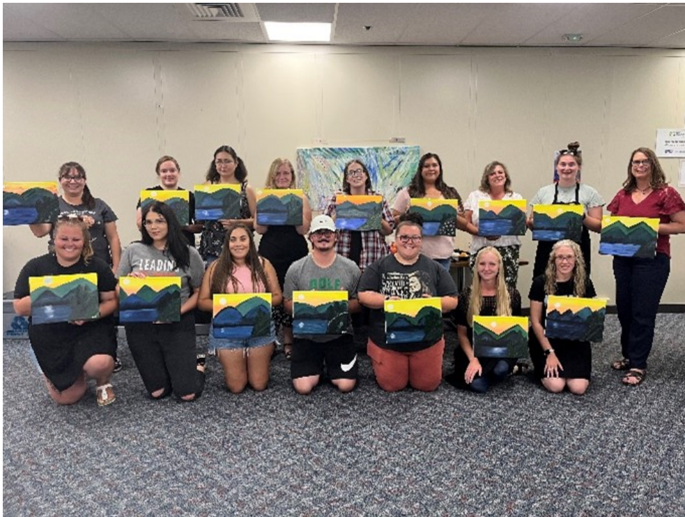
CARE Academy staff canvas painting night

April 22-26, 2024, marks Afterschool Professionals Appreciation Week, a special time to honor, appreciate and advocate for the individuals who dedicate their time and energy to working with young people during out-of-school hours. At United Way of Yellowstone County, we proudly recognize and celebrate the invaluable contributions of our CARE Academy and Discover Zone staff, who play a crucial role in the lives of 348 students in Billings and Laurel.