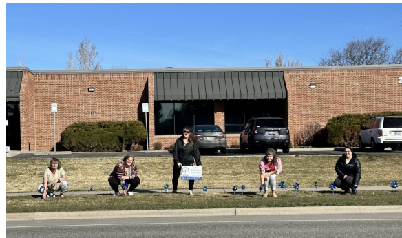
UWYC Staff planting pinwheels