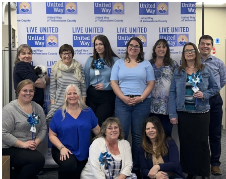
UWYC Staff Blue Monday