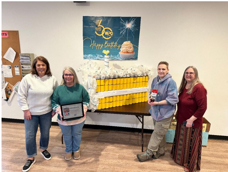
Wood's Powr-Grip celebrating their 60th Birthday with a slice of birthday cake.

Thank you to the Billings YMCA, MARS of Billings, Wood's Powr-Grip, Walmart in Laurel and Walmart in Billings Heights for hosting drop off locations. Thanks to our generous community for donating over 800 items to distribute to local food pantries. Special thanks to our creative construction participants and congratulations to Wood's Powr-Grip for winning this years United We CAN Sculpture Contest!