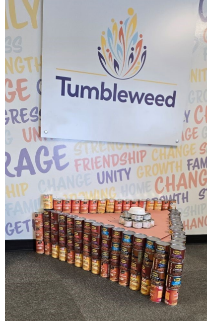
Tumbleweed's slice of pumpkin pie