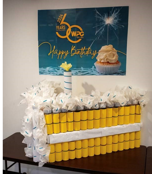
Woods Power Grip Canstruction celebrating 60 years!